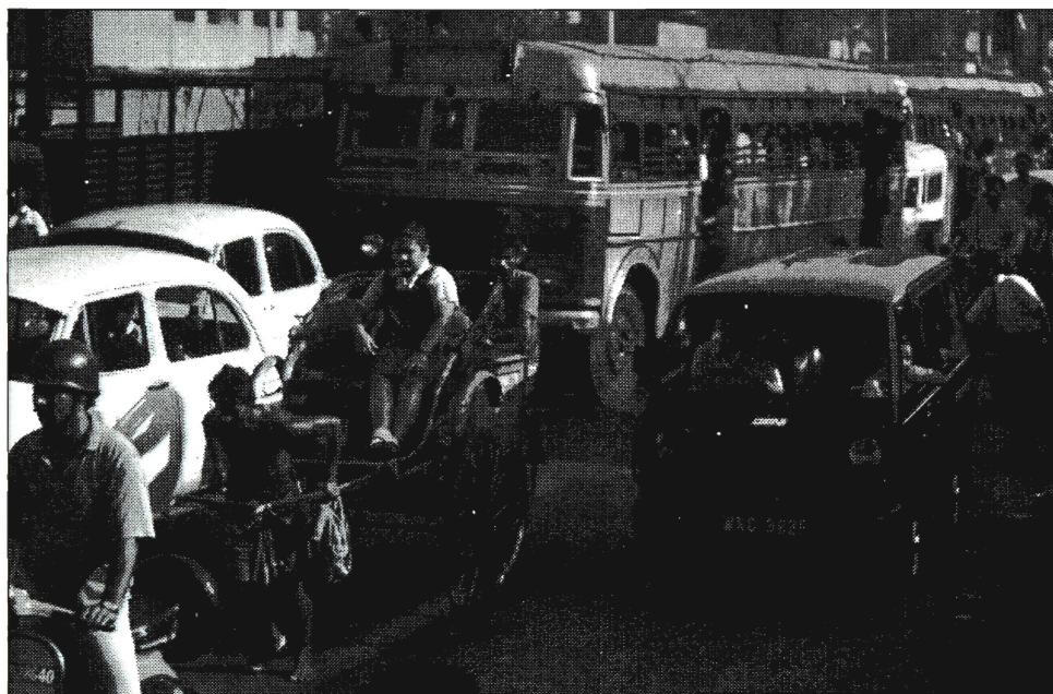
A rickshaw wallah struggles to keep his place amidst heavy early morning traffic.

The vast supply of rickshaw wallahs is consistently fed by an overabundance of poor who eagerly accept this harsh